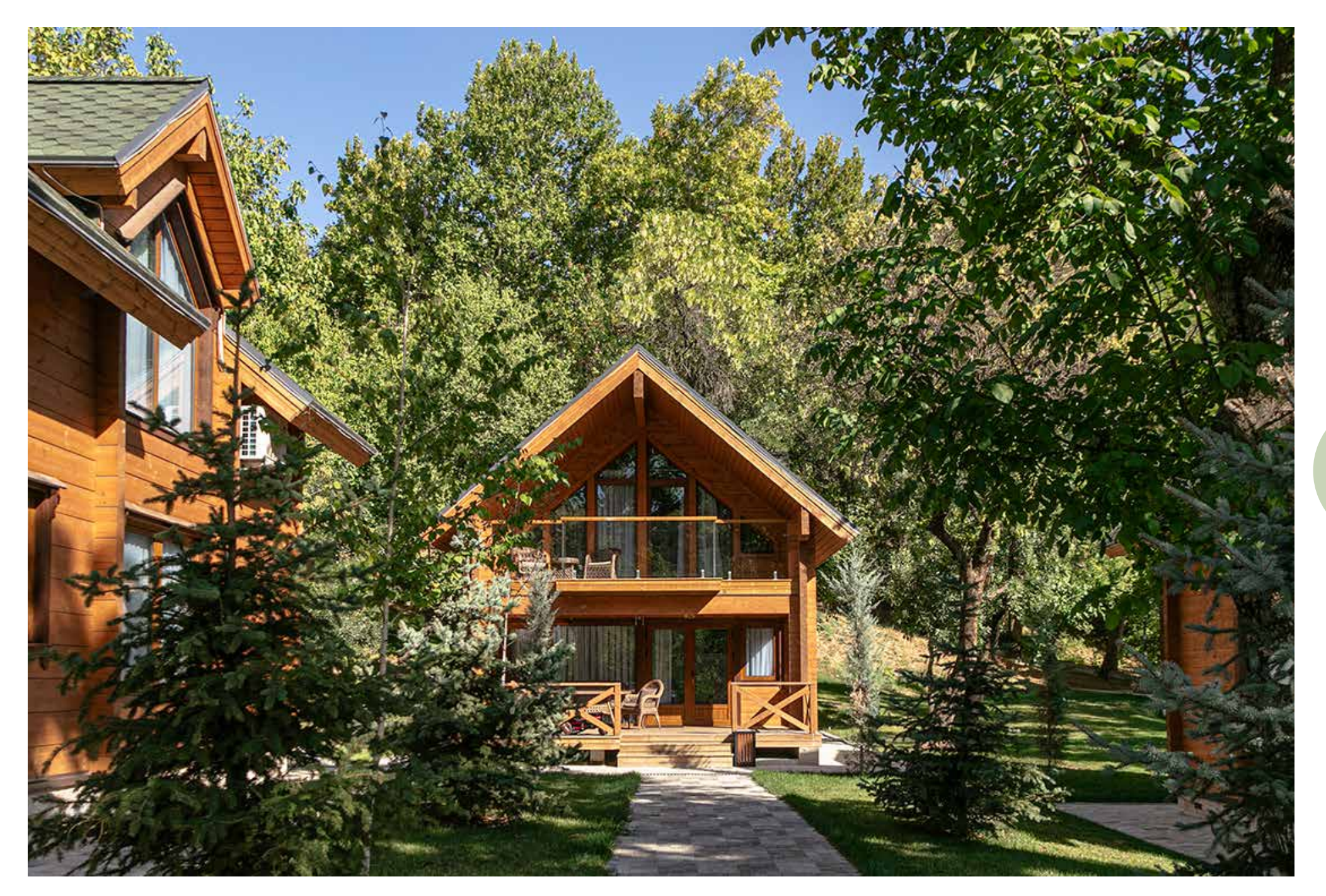
Green Hills Resort, Taškent, Uzbekistan